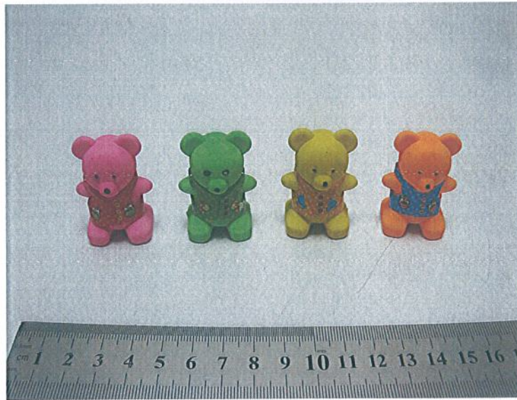
Photo of the sample