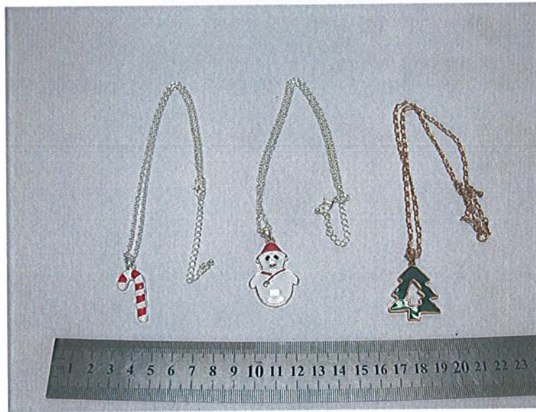
Photo of the sample