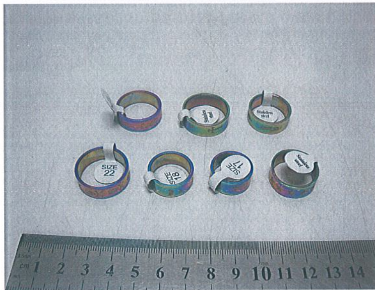
Photo of the sample